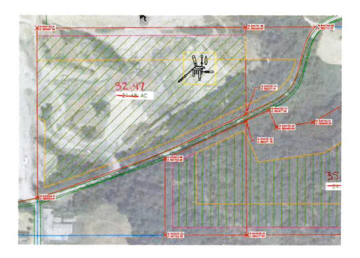
Subject Property's Aerial and PF-80 Zoning Maps